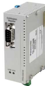
FPΣ FMU CANopen: FPG-CAN-M