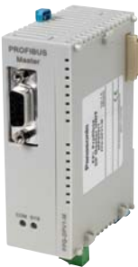
FPΣ FMU PROFIBUS: FPG-DPV1-M