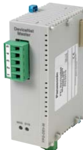
FPΣ FMU DeviceNet: FPG-DEV-M